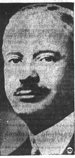
Baron Louis De Rothschild, above, head of Austrian branch of famous banking family, following release by Nazi secret police in Vienna, is reported planning suit against Nazi government to recover fortune.

GENEVA, May 21.—(CP)—Great Britain was understood today to have swung toward the Soviet Russia demand for a three-power mutual assistance alliance as the only means of bringing Russia into the British-French front.