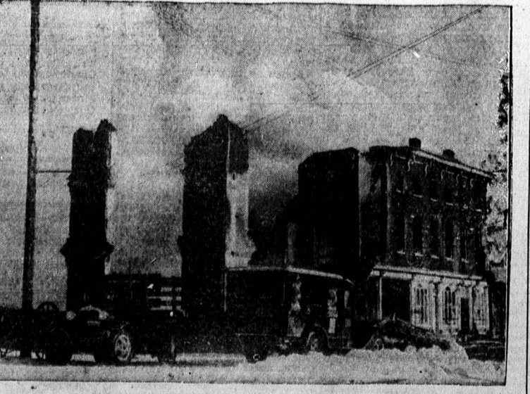
The village of Lancaster, Ont., main section of the village for 12 1/2 miles east of Cornwall, was one-third wiped out as fire raged the $50,000 was done. Picture shows smouldering ruins of one building. Damage to the extent of more than

GIRL GUIDE NEWS First Charlottetown Company