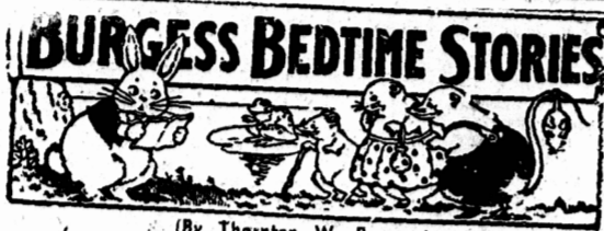
BURGESS BEDTIME STORIES (By Thornton W. Burgess)

In wintertime where you go are stories written in the snow. —Old Mother Nature. "Now what is wrong?" exclaimed Farmer Brown's boy as he heard a great outcry among the hens he had let out in the barn. He ran to a window and looked out. He was just in time to get a glimpse of Reddy Fox running across a field toward the woods. He had no more than a glimpse of view, but that glimpse was enough. That Fox was carrying a hen. It was too late to do anything about it now. That Fox was safely away with his prize. Later, after his morning work was done, he would follow the tracks in the snow and find out where that Hen had been taken. Farmer Brown's boy decided. "I don't believe that was either Reddy or Mrs. Reddy, who live up in the Old Pasture. No, sir, I don't believe it was either of those two. They never have bothered our hens. It must have been a strange fox."