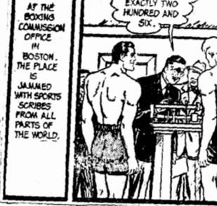
By Zone Grey