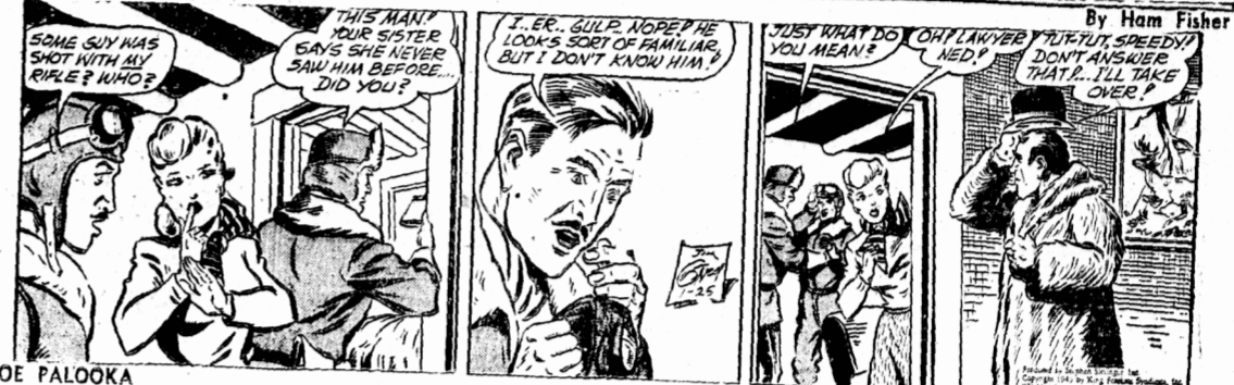
By Ham Fisher