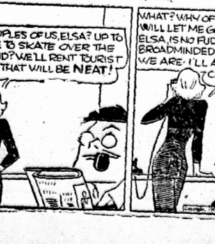
By Harry Haenigsen