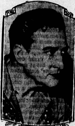
TO SUPPORT HIM

Francis X. Bushman, former screen Adonis, who says he earned and spent millions in the halcyon days and who states that he is willing to take a third wife, provided she is able to support him in the style to which he has been accustomed.