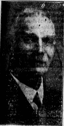
HON. CHARLES DALTON LIEUTENANT GOVERNOR

The fourth session of the 41st General Assembly of Prince Edward Island (the 16th under Confederation) was formally opened with appropriate ceremonial and military display at three o'clock yesterday afternoon by His Honour Hon. Charles Dalton, Lieutenant Governor.