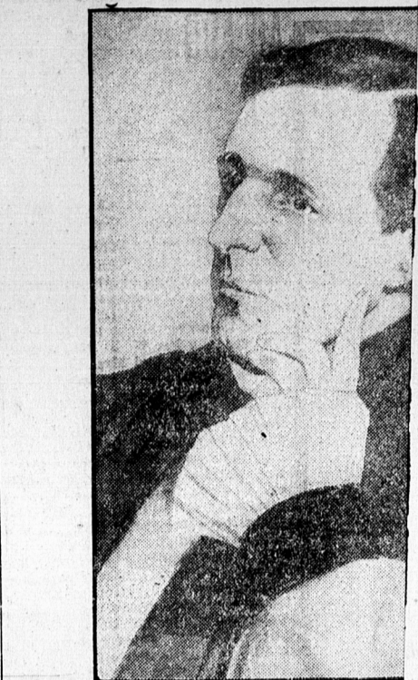
BISHOP OF STEPNEY, LONDON, who has been of the Montreal Diocese and who has refused.