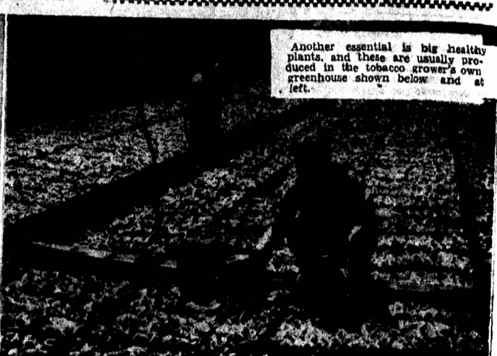
Another essential is big healthy plants, and these are usually produced in the tobacco grower's own greenhouse shown below and at left.