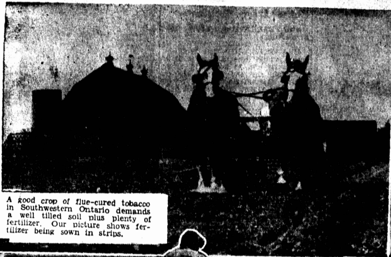
A good crop of flue-cured tobacco in Southwestern Ontario demands a well tilled soil plus plenty of fertilizer. Our picture shows fertilizer being sown in strips.