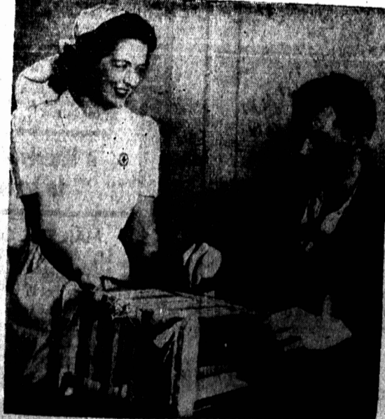
Flora Robson, British and American star of stage and screen, portrays Angelique in Warner Bros. "Saratoga Trunk." Ingrid Bergman, Gary Cooper star.