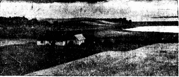
Denmark is predominantly agricultural. The greater part of the country is flat and well irrigated throughout. Although ravaged by the war, as those in picture below, are well kept although small and the fields clean and intensively cultivated.