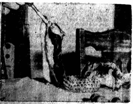
Found last fall by William C. Linton of South Bend, Ind., these two flying squirrels were nursed through the winter on warm milk fed with an eye dropper. The squirrels have started to eat nuts but their diet is still supplemented with warm milk.