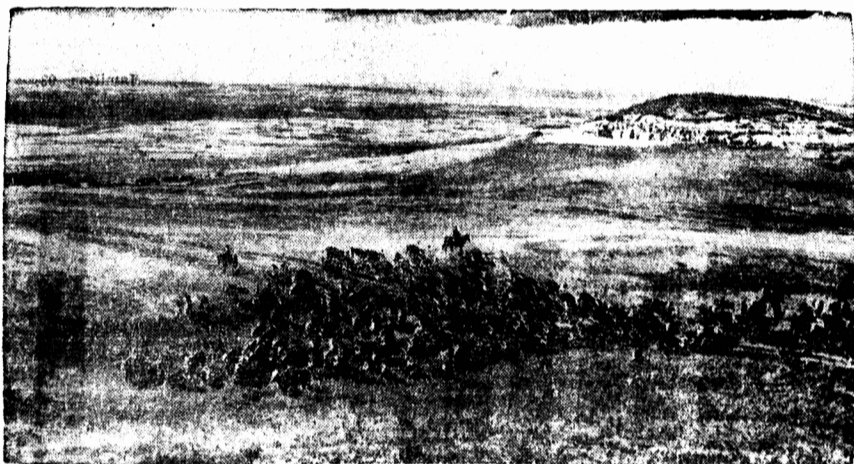
Feeder cattle move from the ranch to the feedlot, a typical Southern Alberta scene.