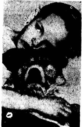
SAVED HIS DOG

HUGE SPAN Calcutta has one of the world's largest cantilever span bridges—the new Howrah Bridge—with the span measuring 1,500 feet.