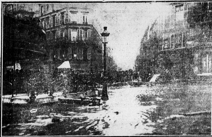
Again history repeats itself. The Paris suburbs are once more filled with the angry waters of the Seine. It is believed that the floods will rise above the high mark of 1920. The damage is estimated in millions of francs.