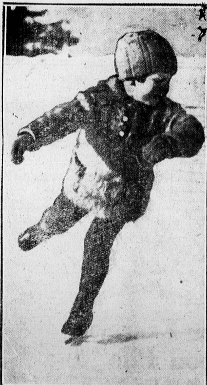
Her stunts are the envy of others several times her age. With the cold weather and ice on the ponds and open spaces, Canadian youth is given an opportunity to try out the skates Santa left.