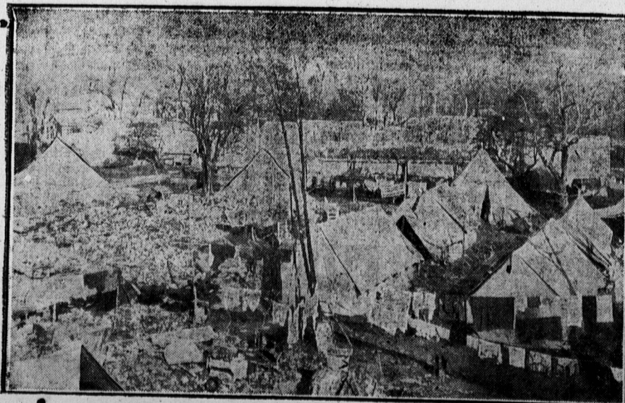
Here is the American embassy in Tokio, three months after the earthquake and fire. The tents are used by the marine guard and members of the staff, who are taking no chances with heavier building materials.