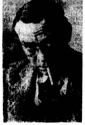
W. O. Mitchell, (top), High River, Alta., has been awarded the $500 prize by the Echoes committee of the I. O. O. F. for his novel, "Who Has Seen the Wind." Professor Paul G. Hiebert (bottom), of the University of Manitoba, won the Leacock Medal for Humour with his satirical book, "Sarah Binks."