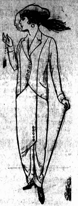
This Style $20.00