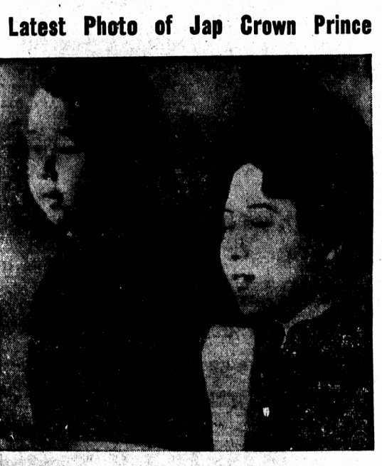
Latest Photo of Jap Crown Prince