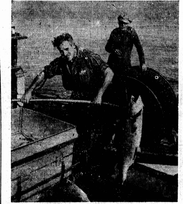
Here's a hefty gill-netted salmon about to be weighed. To the crew of this B.C. salmon fisherman who may net $5,000 during a good year, he represents big business.