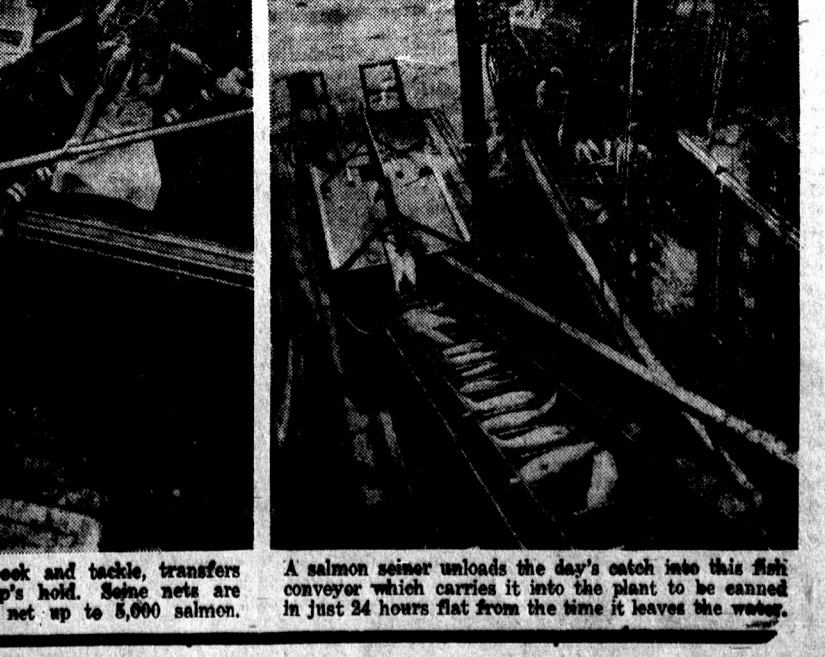
A salmon seiner unloads the day's catch into this fish conveyor which carries it into the plant to be canned in just 24 hours flat from the time it leaves the water.