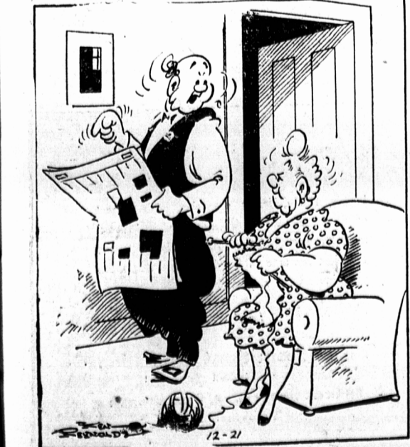
"What happened to today's paper — find lots of bargains in the Guardian Want Ads again!"