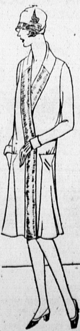
By Marie Belmont

Soft wool crepe in navy blue makes the coat above, which is as dignified as it is smart. Softly rippling side pieces are applied for fullness the top forming unusual pockets. Corded navy blue faces the revers of tuxedo inspiration. Navy blue crocheted straw trimmed with belting ribbon makes the mail hat.