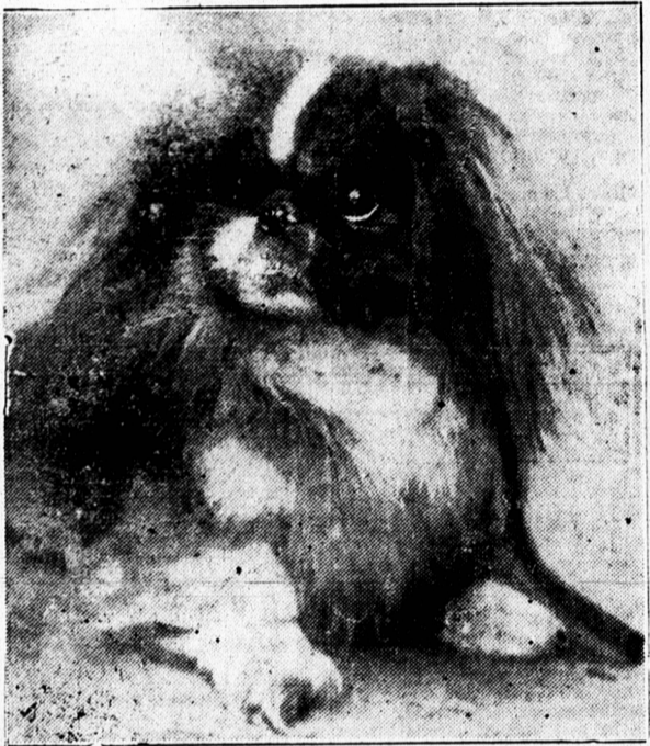
Ch Tui Yang of Newham, a champion in the International Dog Show in London, looks as though he was fully aware of his own importance.