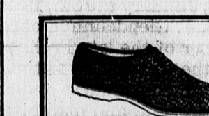
"SPOR-TIE"—Basket weave fabric upper, 3 eyelet tie. Re-ly-on soles. Misses' and children's sizes.