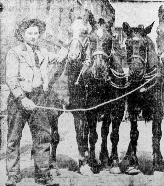
Horses have their place in war as much as mechanical vehicles. Here are Ontario Horses bought from farmers by the French remount commission. They will leave Toronto to become gunner and cavalry mounts in France's army.