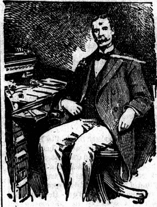
SIR THOMAS J. LIPTON.