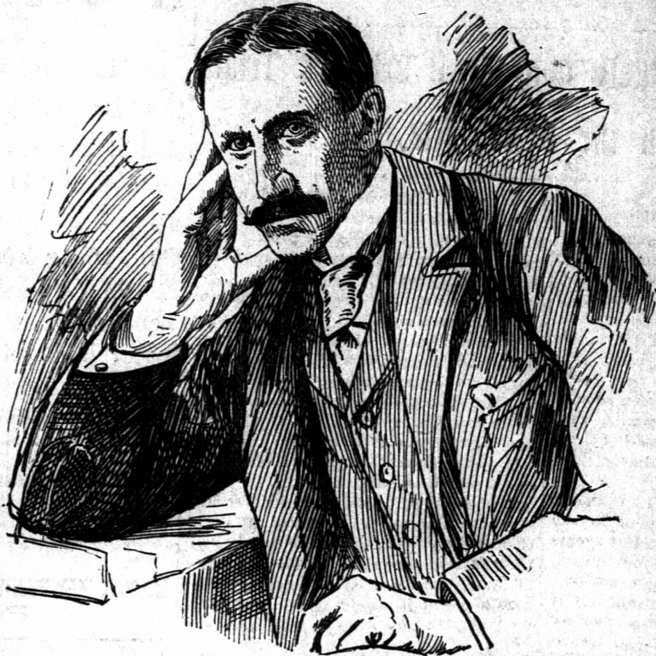
Sir Alfred Milner.

that are washed with SURPRISE Soap—a little Surprise Soap and still less labor—are not only clean but uninjured. You want the maximum wear out of your clothes. Don't have them ruined by poor soap—use pure soap. SURPRISE is a pure hard Soap.