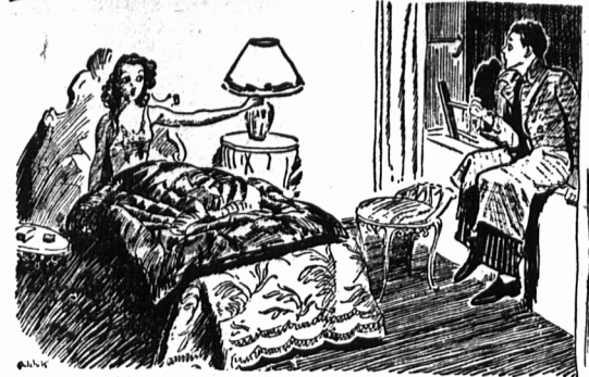
"I owe you an apology, Hazel. I've just remembered it's Muriel I'm supposed to be eloping with." —Humorist.

today as financial centres studied European developments. Brisk buying propelled leading issues up fractions to two points.