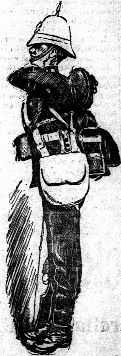
HEAVY MARCHING ORDER—CANADIAN BATTALION.