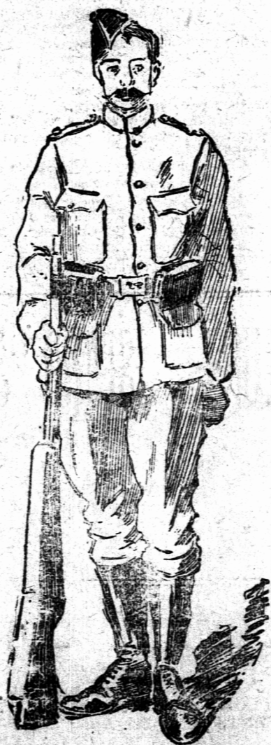
KHAKI SERVICE UNIFORM—CANADIAN BATTALION.