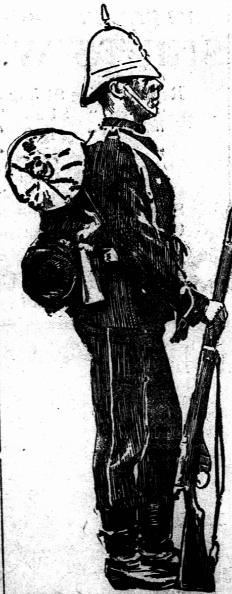
HEAVY MARCHING ORDER—CANADIAN BATTALION.