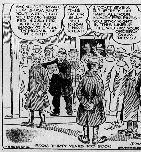
BORN THIRTY YEARS TOO SOON