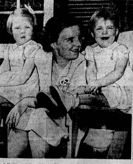
Princess Juliana and her older children are shown in a recent picture from her hospital window at their Ottawa home. They are Princess Beatrix, on the left, and Princess Irene.