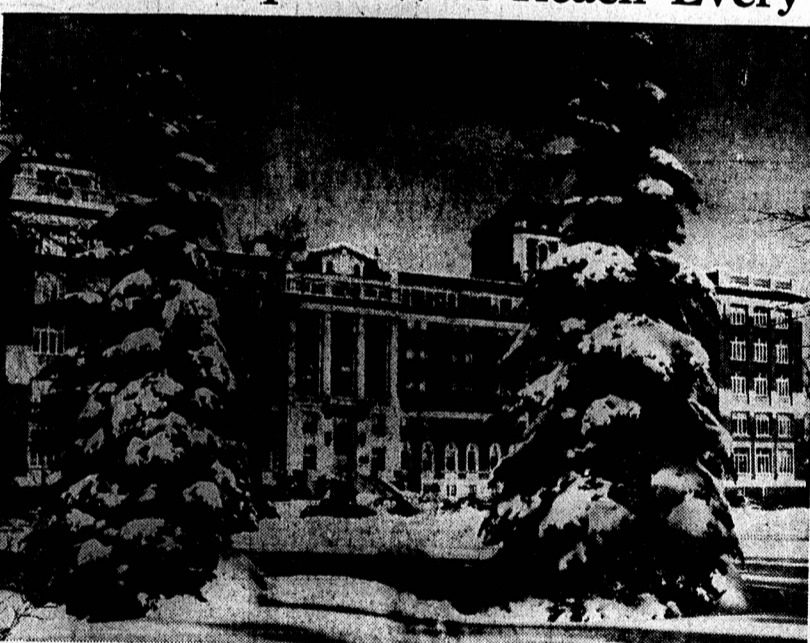
In this Canadian hospital a child was born whose arrival was awaited by every loyal subject of Queen Wilhelmina of the Netherlands. By short wave radio the news has been flashed to countless secret receiving sets in Holland.