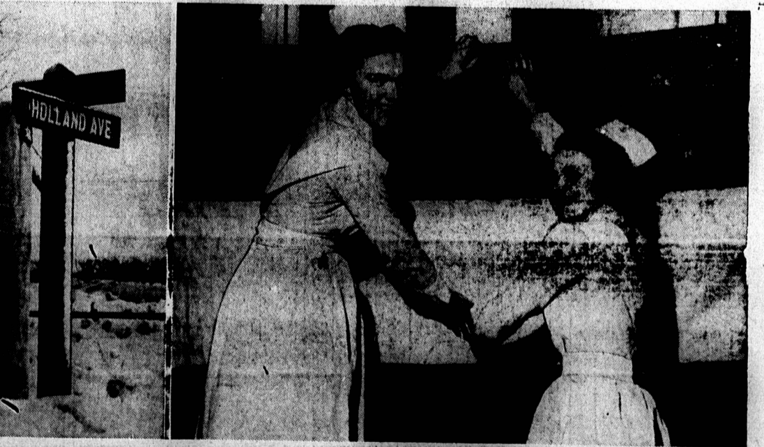
In preparation for the arrival of Princess Juliana at the hospital, these pretty nurses decorated the wall of the corridor outside her room with the Royal Netherlands flag. The Princess moved into her room on Monday, Jan. 18.