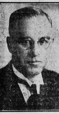
HON. DR. W. J. P. MACMILLAN Premier of Prince Edward Island