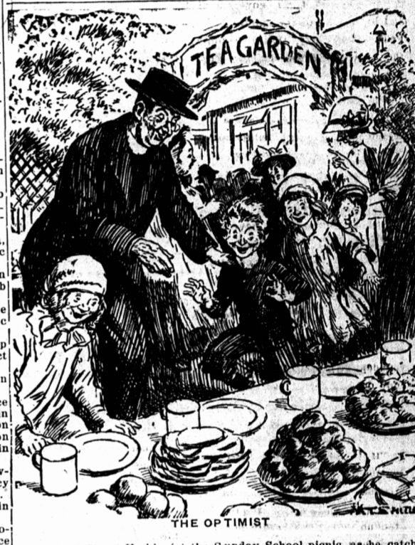
Invited Street Urchin (at the Sunday School picnic, as he catches sight of the well spread table): "I, umm—ain't I goin' ter be sick goin' home."

ALREADY THERE (Biston Transcript.) "Cohenstein was all purred out undt no insurance." "Dot will drive him crazy, von't it?" "He must haff been crazy alretty, before." Minard's Liniment Relieves Pain. A HANDY EXPLANATION "Daughter, I hope your fiance is not losing interest in you." "Impossible." "He seems a fine young man, but I find he has been sending telegrams to some person about peaches and pippins." "Political stuff, maw, political stuff."