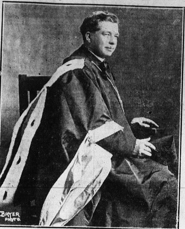
EDITOR OF CATHOLIC REGISTER APPOINTED DIVISIONAL CHAPLAIN OF THE OVERSEAS FORCE.