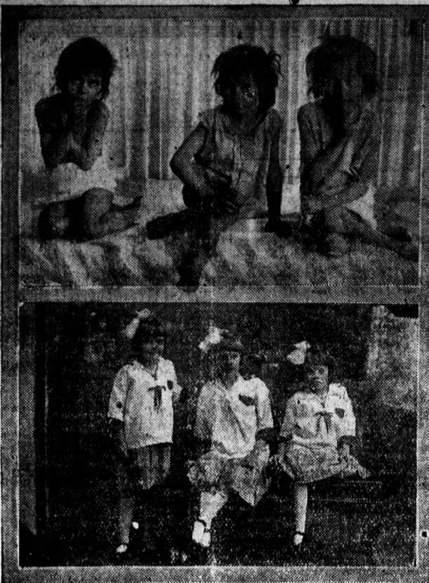
A MIRACLE OF CHARITY

Eighteen months ago three children were found in an isolated section of Manitoba, near Whitemouth, half naked and starving, both their parents having died. They were taken in charge by the Salvation Army in Winnipeg and are now well developed and cured of the disease which had crippled them. The upper picture shows the children as they appeared when rescued from their shack; the lower picture shows them as they appeared today.