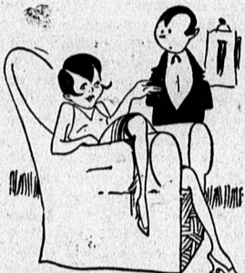
"Mrs. Knagg: Before we were married you said you would give the biggest part of your life to live the rest of it with me. Mr. Knagg: I know I did but I find that I've reserved too long a portion to be lived with you."