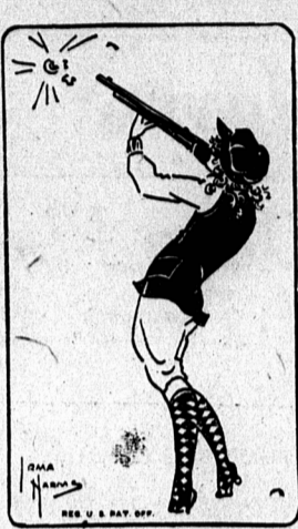
GABBY GERTIE "New Year's resolutions are like city pigeons—the more you make the more you break."