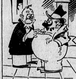
"Why did you never marry?" "I don't feel that I could support a wife." "Don't let that worry you. If she finds you can't she'll leave you."