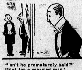
"Isn't he prematurely bald?" "Not for a married man."