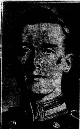
LOLD LOUIS MOUNTBATTEN

Cousin of King George, who suffered a broken collarbone in London, the result of a polo mishap.