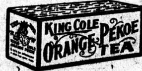
You will enjoy King Cole Coffee too

King Cole Orange Pekoe Tea costs more—but it's worth more.