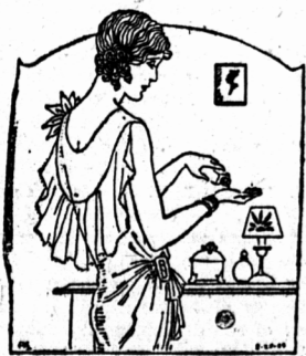
Most hands need a soothing lotion

To be sure the problem does seem almost impossible, but getting right down to business, isn't the feeling that one still has some claim to