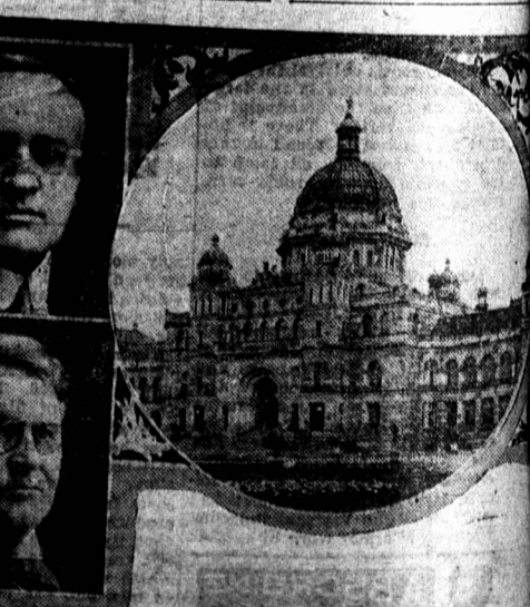
FIGURING IN THE BRITISH COLUMBIA ELECTIONS After eight years in office, the Liberal party of British Columbia picture appears in the upper left-hand corner, will appeal to the voters (upper left) is Leader of the Conservative party, while Glen who is a son of Sir Charles Tupper, one of the Fathers of Confederation. Minister about thirty years ago, is supporting the Provincial more than twenty years the British Columbia election will be a three party fight. The building shown on the right is a part of the magnificent Parliament Building of British Columbia, overlooking the harbor at Victoria.