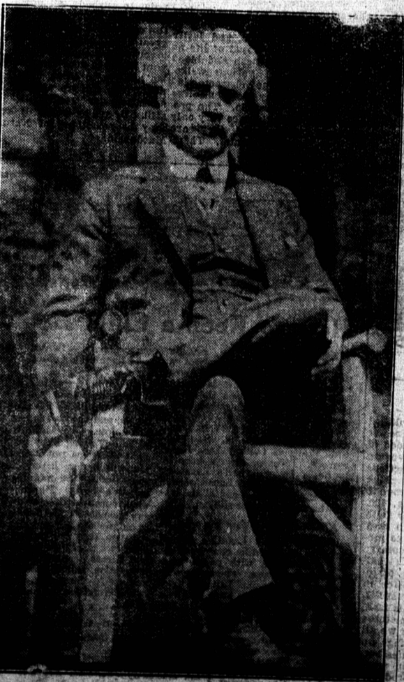
THINKING ABOUT THE IRISH BOUNDARY DISPUTE Sir Robert Laird Borden, former Premier of Canada, snapped in an unconventional attitude in London, Ontario, a few days ago. He has been offered the position of Chairman of the Irish Boundary Commission but has not yet accepted. Sir Robert will be seventy years old on June 20th.