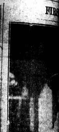
A new picture of Mr. Exchange. This photograph 29th to present his budget script of the budget can

Although New York has developed a line of its own in men's styles, most Americans have settled back definitely into an adherence to the Savile Row standards, this London style expert said. "Men from the Dominions have always followed the English fashions. When our visitors come to replenish their wardrobes in London they will find lots of changes. For one thing, they will find patent shoes are now very fashionable for day wear as well as evening dress. In the matter of collars there has been a definite change. The white linen double collar has again been established as almost the only 'real' collar. Soft collars to match shirts have almost disappeared for town wear, and smartly dressed men, although Canadians, however, it is still worn in the country. The reason given for this being that the