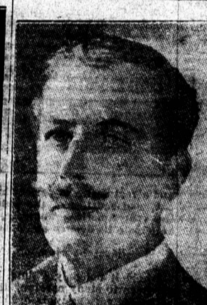
DUKE OF ABERCORN Governor-General of Northern Ireland, upon whose shoulders may fall the responsibility for appointing Ulster's representative on the boundary commission.