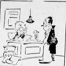
Written: I'm going to get out a new paper. Suggest a good motto for it. Scribbler: How would "Light For All" do? Written: Nix on the light game. It's to be a matrimonial paper.