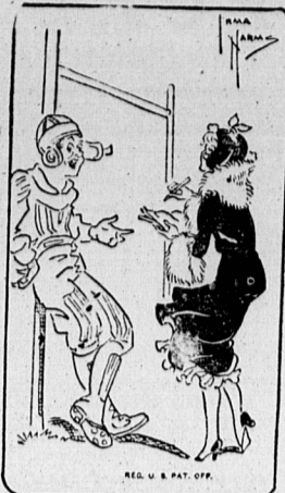
"It's astonishing to what ends a reporter will go to get football stories."