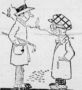
"So you were at the Smythe-Cay wedding, eh?" "Yes." "Who gave the bride away?" "No one. She married money."