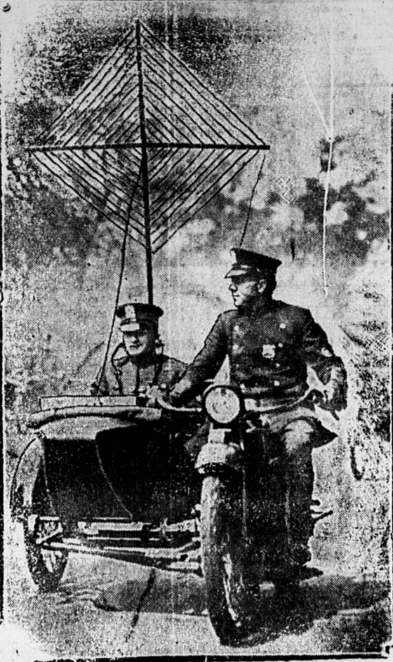
New York's squad of motorcycle police now includes the radio officers. This photo shows how they work.