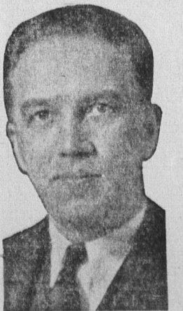
PREMIER A. CAMPBELL In the confident hope of ultimate victory, and lasting peace, the Government of Prince Edward Island wishes a Happy New Year to all the readers of The Guardian, and particularly to all members of His Majesty's Active Service Forces. Thane A. Campbell, Premier.

Maritime East: Fresh or strong winds with rain and considerable fog. Synopsis: The weather has become somewhat colder over Ontario with light snow in many districts. Part rain in east portion. Except for local snowflurries it has been fair over the Prairie Provinces with moderate temperature. WEATHER FORECAST — For January 1 to 6 becoming colder, to 13 mostly fair with light snow, 14 to 20 milder with sleet or rain, 21 to 27 extreme cold with much snow, 28 to 31 fair and cold. High tide this afternoon at 12.46 and tomorrow morning at 1.15. Sun sets this afternoon at 4.28 and rises tomorrow m-rising at 7.38. First quarter moon Jan. 5, 9.40 a.m. Summerside tide 18 minutes later than Charlottetown. THE CAR FERRY SAILINGS Leaves Bord n 9.45 A.M. 1.00 P.M. Leaves Tormentine 11.00 A.M. 3.15 P.M.