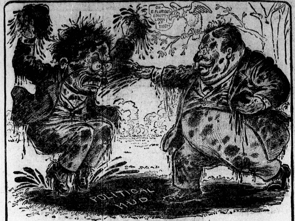
When President Taft and Col. Roosevelt are through with their mud slinging, they must clean up.

"2 in 1" Shoe Polish is the very best thing for their boots as all good Canadians and Americans realize. Best by test. Will not soil the daintiest garments. Quick brilliant, lasting. No other even half as good.