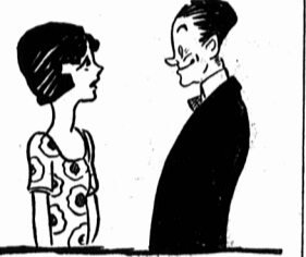
WHY HE DIDN'T SWEAR AT 'EM "You wouldn't think of swearing at a woman you say?" "Of course not—I don't like to be cussed back."