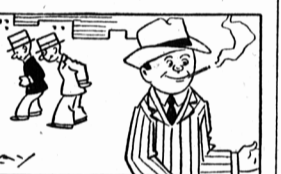
AN OLD RAKE "He's drunk so much he's lost most of his teeth." "What do you expect in an old rake?"