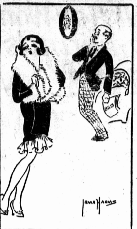
"The girl who looks stunning generally has a dad who looks stunned."