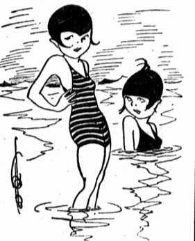
"I wonder what kind of a girl Lindy'll finally marry?" "Oh, probably some high-flier."