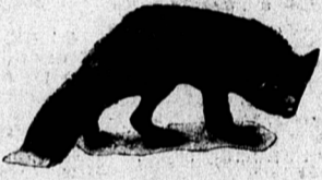
FOX FURS. Some special Fox Sets. See them.