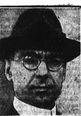
SIR RICHARD SQUIRES