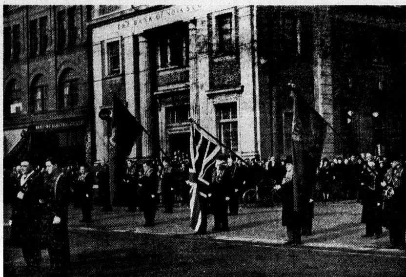
Parade leaving B. I. S. hall, Bank of Commerce corner, in Monday's big turnout in honour of Saint Patrick.