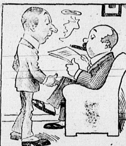
"What lost stringing from the electric?" "He promised the westinghouse more work."