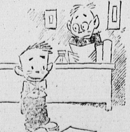
"Please, sir, me gran'mother—" "Wim, yes I know that old story, she's dead and—" "No, sir, Me gran'mother wants to get off an' take her to de bell'!"

And now the baseball season's on the wane; His swansong is the gloomy fan's refrain; The umpire thanks his lucky stars That he's not sadly missing 'em again!"