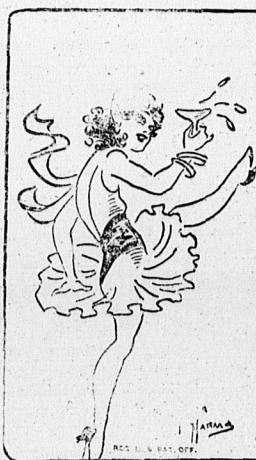
"Comedy and a strong sense of humor isn't bread within."