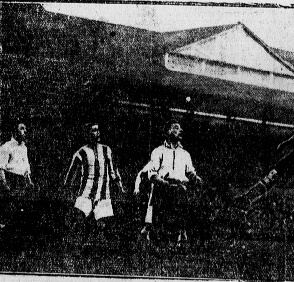
An unusual snapshot of an exciting moment in the second cup tie game between Corinthians (in white shirts) and Brighton Hove. Corinthians were finally beaten after three games had been played.