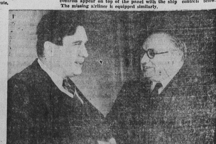
Meets Labor Minister Ernest Brown