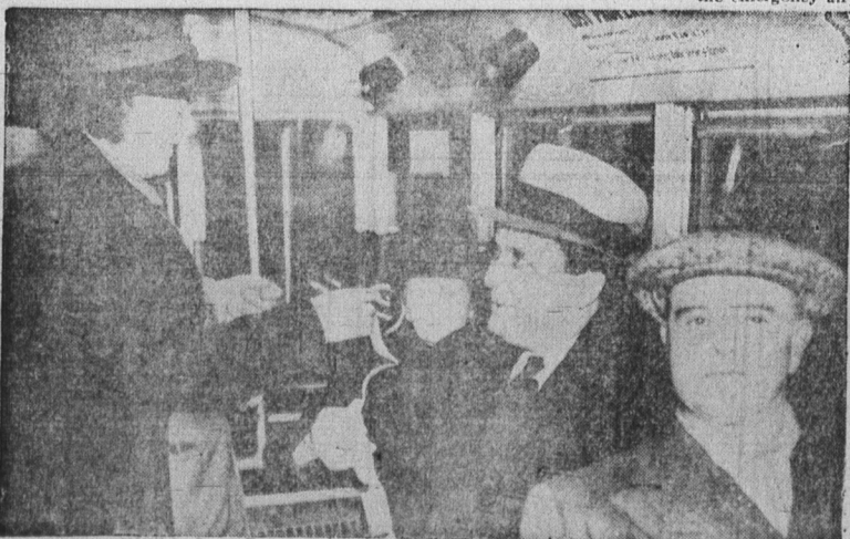
Willkie Pays Fares to London "Clippie"