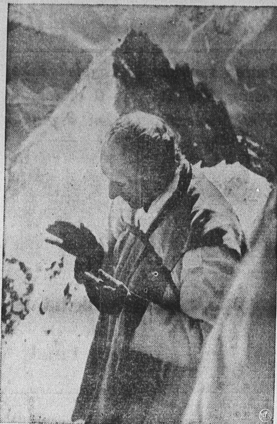
High in the sunlit Swiss Alps, yet undarkened by war, a parish priest celebrates the holy mass, a symbol of peace on top of a continent covered with conflict. Occasion was the placing of a great wooden cross at the peak of 12,969-foot Mt. Eetschhorn above the Lotschen Valley of Switzerland.

Testifying in support of the U.S. lend-lease bill, James W. Gerard, ambassador to Germany from 1913 to 1917, predicted the Nazis would "seize" Mexico if Britain were defeated, and came out for a declaration of war. He said he could see no hope of a negotiated peace.