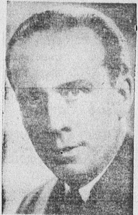
Jean Desy, former Canadian minister of Belgium and the Netherlands, is being named to the newly-created post of Canadian minister to Brazil, it was learned in Ottawa.