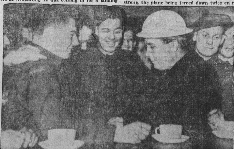
Chats with London's Defence Forces