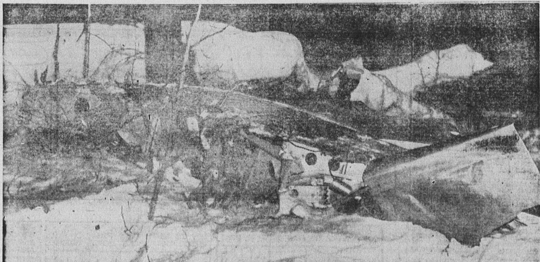
Jagged silver wreckage is all that is left of the Lockheed air transport operated by T.C.A., where it lies in a swamp a mile south of the emergency airport at Armstrong. It was coming in for a landing