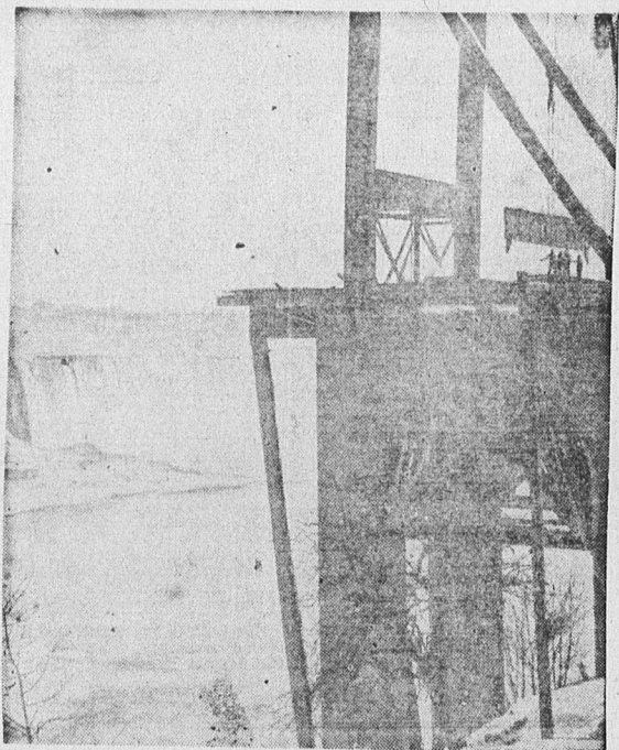
Winter ice wrecked the old Honeymoon bridge at Niagara Falls, and old man winter, playing havoc with the weather, now is delaying the placing of the first section of the great arch of the new Rainbow bridge. Meanwhile steelmen, working from abutments, built high above the dangerous ice so the river won't claim a second bridge, are completing the 130-foot towers. From these will be strung cables to support the arch as it is built outwards from the Canadian and U.S. shores. Once locked at centre, it will be self-supporting.