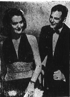
Used Napkin Left Under Plate

It's the little things that count in table manners and a smart hostess is oh, so aware, whether you observe them!