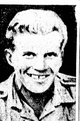
Stalling Nazi paratrooper seems quite undismayed by his capture by Allies in Tunisia.