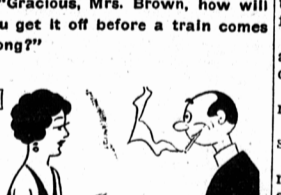
JUST EARNS FOR HER NOW

"Gracious, Mrs. Brown, how will you get it off before a train comes along?"