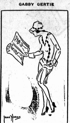
"Every twenty years the popular skirt length is a fraction over two feet."