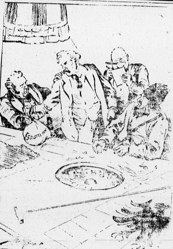
ROUGE ET NOIR

John Bull: "Hey, where are you going to put all that money?" Ramsay the Reckless: "On the 'rod,' of course." John Bull: "Stop a minute! You've already thrown away £10,000,000 on the 'black.' Don't you think that's enough?"