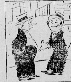
"I am going to the ball game." "What for?" "Just to kill time." "Why waste your ammunition when the umpire is there?"