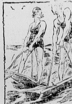
"Then I may ask your father for your hand?" "No, you silly thing! Tell him Don't ask him!"