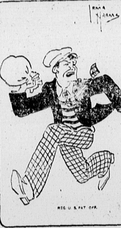
"An actor playing the villain goes at his work like a streak—a yellow streak."