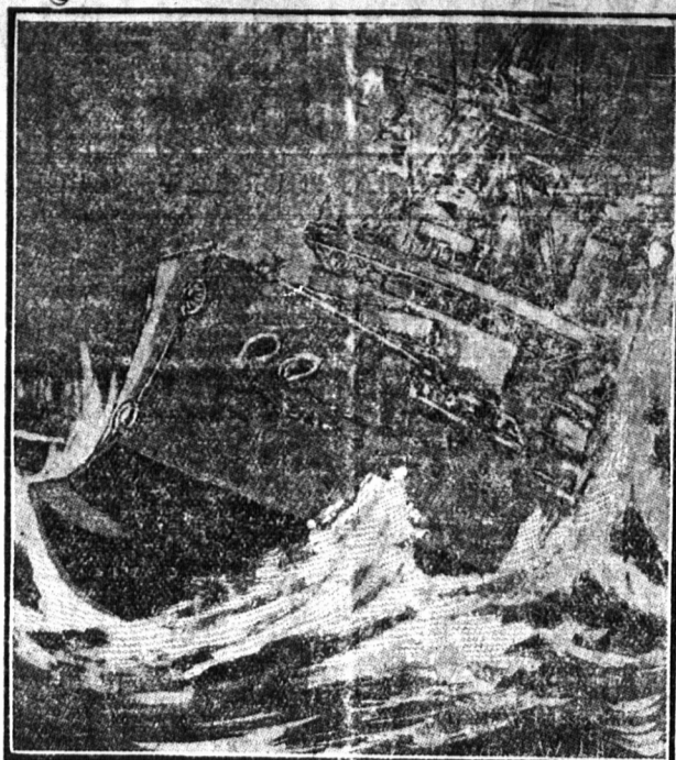
ACTUAL MOMENT WHEN HATUSE WENT UNDER.

The list might be indefinitely extended, but here are items totalling over seven millions, to which the Island contributes at least $140,000 a year and for which we receive nothing in return. Take the item of railway subsidies for which since 1883 more than $50,000,000 has been paid by the Dominion, not one dollar of which has been spent in P. E. I. This does not include the payments in money and lands to the Canadian Pacific Railway. All of which goes to show that we are paying