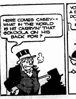
TIPPY AND "CAP" STUBBS