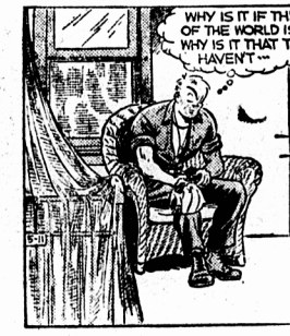
BRINGING UP FATHER