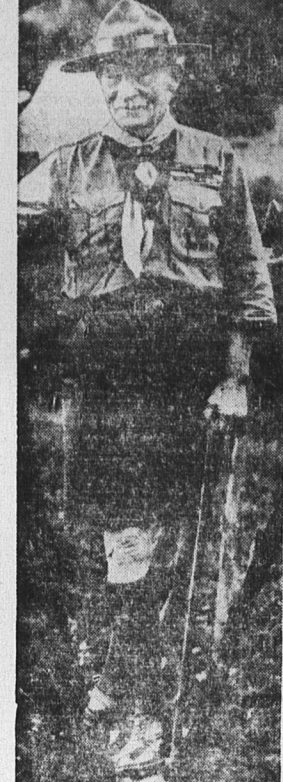
Founder and chief of the boy scout movement, Lieut.-Gen. Lord Baden-Powell, died, Jan. 8, at his home in Nyeri, Kenya, where he retired in 1938. He would have been 84 next month. A distinguished soldier before his retirement in 1910, he organized and led the heroic 217-day defence of Mafeking during the Boer war. It was in South Africa that he started the scout movement, and later he organized the girl guides. During the great war he was one of Britain's shrewdest and most daring intelligence agents, but the story of his exploits has never been told. In these pictures, the chief scout is shown at LEFT as he appeared during a visit to Canada in 1935. At CENTRE, he inspects a group of wolf cubs, the junior scout organization. At RIGHT, he attends a levee in St. James' palace.