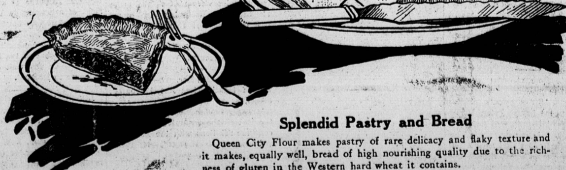
Splendid Pastry and Bread

Use our flour. Then you can always be sure of happy results. It always contains just the correct amount of Ontario winter wheat for flavor and flaky texture—always exactly the right proportion of Manitoba spring wheat for fine big loaves of nourishing, delicious, flaky bread. No occasions occur when extra quantities of expensive shortening are needed to counteract over-strength in the flour when making pastry—and bread always rises properly. Try Queen City Flour for uniformly good baking results.