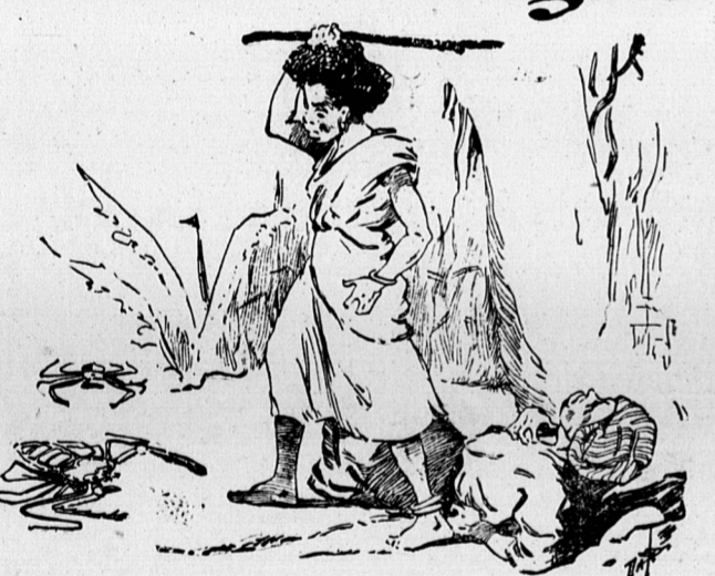
"KILLS THE GIANT SPIDERS"