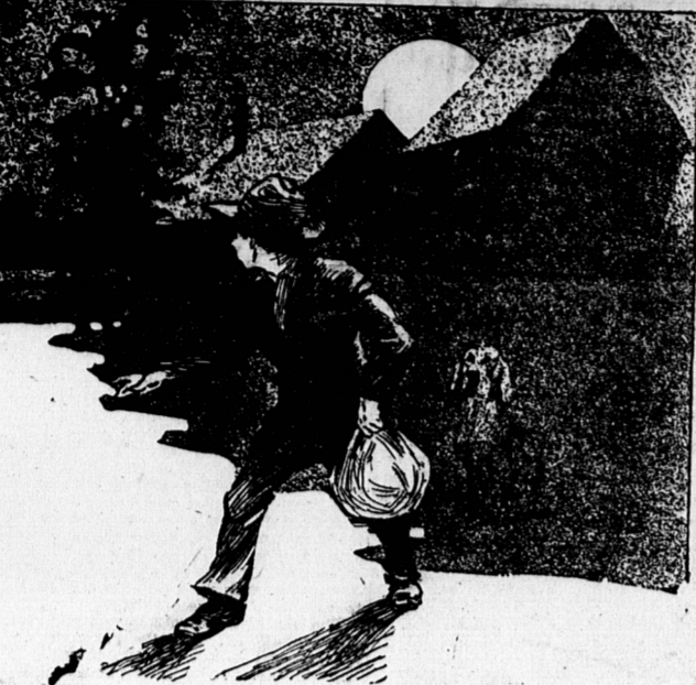
COMMANDS THE DOG TO STAY HOME.

THE Blue Butterfly had grown very conceited, and because the birds and the flowers told her so many times a day how delightful she looked with her daintily marked wings, she began to think of nothing else but her own beauty. One day, when she was idly flitting about in the sunshine, a little boy came running out into the garden. "Oh, what a pretty butterfly!" he cried. The Blue Butterfly was delighted, and flew close to let him see her pretty wings. "Be careful! Be careful!" whispered the Wind. "He'll catch you if he can!" But the Butterfly took no notice. She only thought how nice it was to be admired by a real boy, as well as by the birds and flowers. She flitted gracefully about, but suddenly she happened to look up, and oh! what was happening! The boy had taken off his cap and was bringing it down sharply over her. It came so swiftly that she could not escape. How dark and hot and dreadful it was under the cap! The poor Butterfly fluttered about, but saw no way of escape. Stay! The Wind was blowing a corner of the cap so that it rose a little from the ground. "Come along! He's gone for a match-box to put you in," he whispered. The Butterfly crept out, then away she flew to rest and recover on a friendly flower. "Oh, thank you, thank you, dear Wind," she said. "You've saved my life, and I've learned a lesson, too—I shall never be so vain again!"